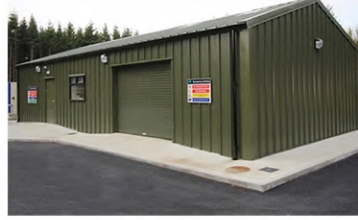
Ground Maintenance Workshops & Stores