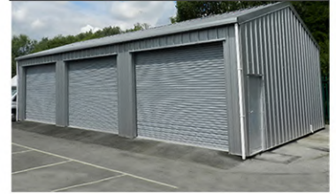
General Purpose Industrial Units