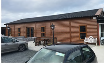
Coffee Shops, Farm Shops & Meeting Rooms