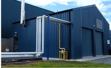
Recycling and Waste Transfer Stations