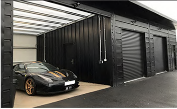
MOT Bays, Valeting Bays & Body Shops