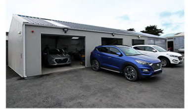
Secure Vehicle & Plant Storage Buildings